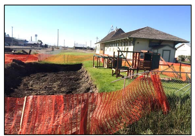
Daycare playground, formerly contaminated with heavy metals; Deer Lodge.