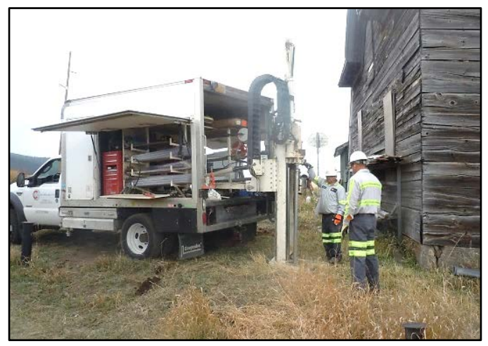
Direct push rig – determining extent of excavation; West Yellowstone.