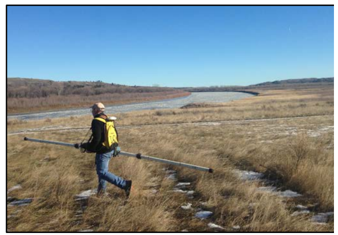
Using Electromagnetic Survey technology to locate buried arsenic bait along Missouri River.