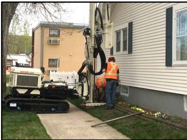
Testing soil for petroleum near residence, Lewistown (May 2016)