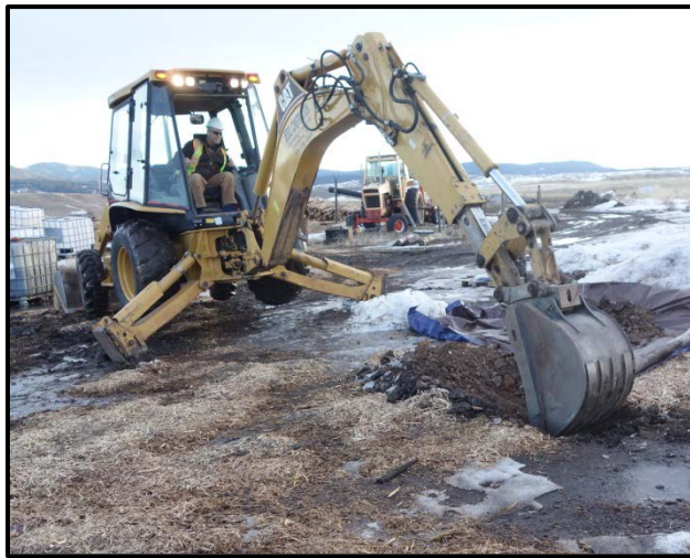
Former wood treating facility, Lewistown (Feb. 2016)