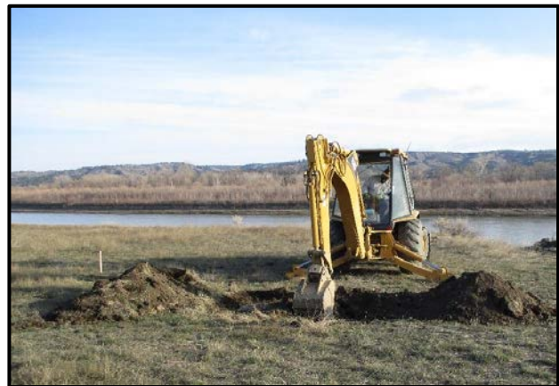
Test pit to locate potential buried pesticide at wildlife refuge, Roy. Missouri River in background (Mar. 2016)