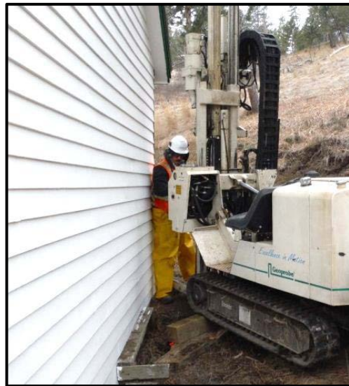
Drilling in "tight quarters" at former Unionville Schoolhouse (March 2016)