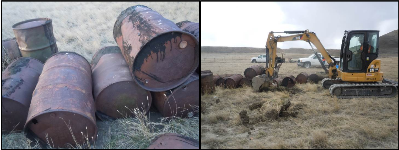
Characterizing abandoned (unknown waste) drum site, Black Eagle (April 2016)