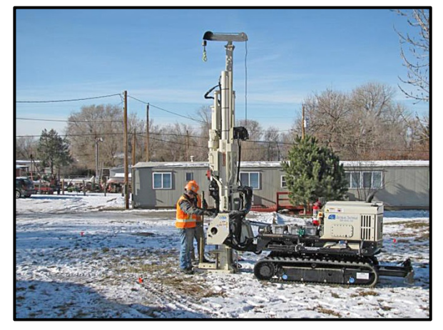
Using GeoProbe to measure contamination near residential area; Billings (Dec, 2015). This site is now resolved.