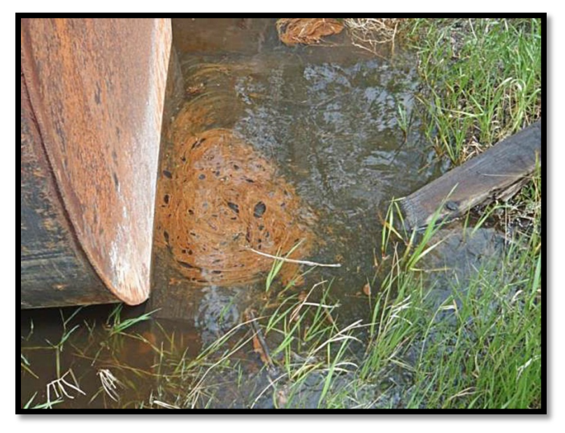
Petroleum product floating on groundwater; Harlowton. (Cleanup scheduled for summer 2016)