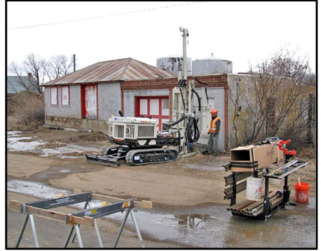
GeoProbe installing borings at former service station, Plevna. (Feb. 2016)