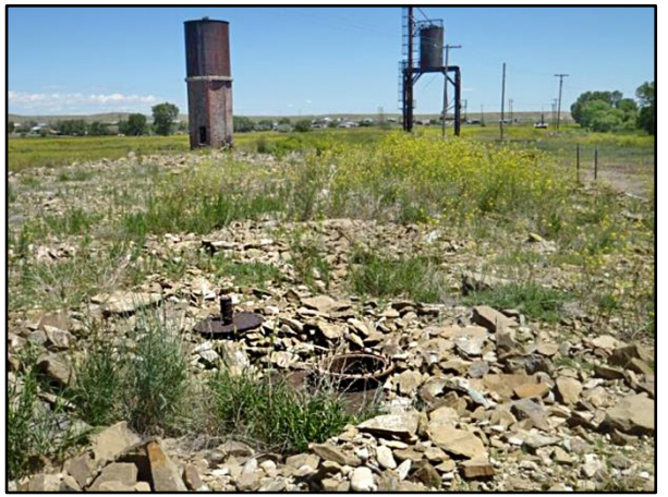
Top of buried rail car containing free product. Waste oil tank in background; Harlowton. (cleanup scheduled for summer 2016)