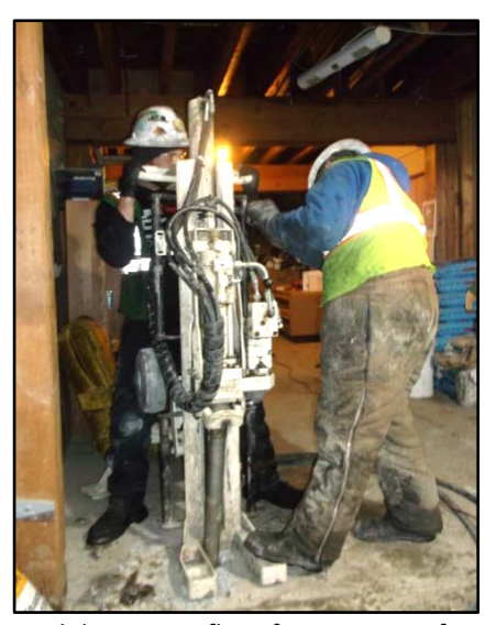
Drilling through basement floor for injection of in-situ treatment chemicals near former dry cleaners, Havre (Feb. 2016)