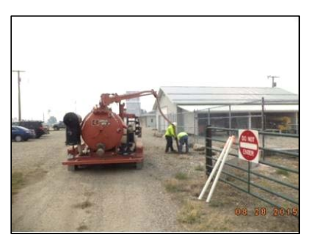
Using vacuum truck to daylight fiber optic line prior to excavation of contaminated soil; Deer Lodge (Sept. 2015)