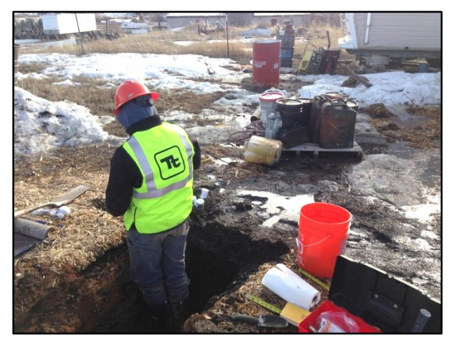
Sampling test pit of former dump and wood treating operation for pentachlorophenol and petroleum, Lewistown. (Feb. 2016)