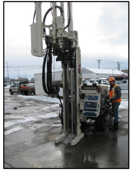
GeoProbe rig installing soil boring at a former service station, Billings (Jan. 2016)