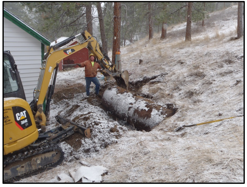
Removing half-buried tank at Unionville School (March 2016)

May 4, 2016 Meeting (data as of April 8)