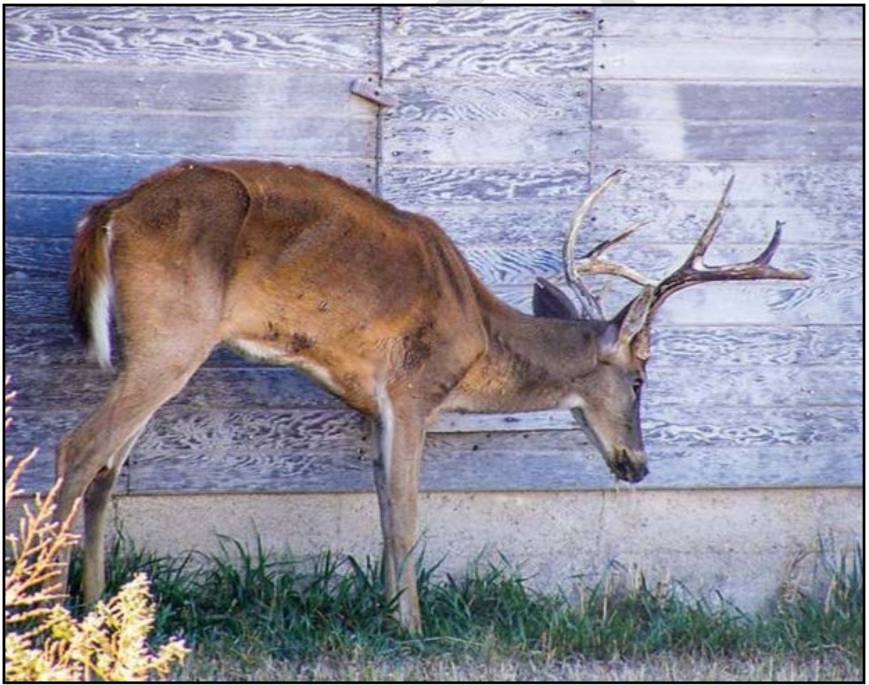
A CWD-afflicted white-tailed deer. This animal will die soon.

Montana Fish, Wildlife and Parks CWD Action Team May 19, 2017