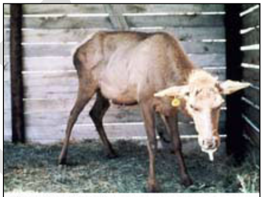
AT THE END: An elk in the final stages of wasting disease

contact but can also be transmitted by contact with a prion-contaminated environment such as grass and soil. Infected animals shed prions in saliva, feces, and urine for most of the course of their infection, and via bodily tissues and fluids upon death, and these prions may remain infectious in the environment for at least 2 years (Miller et al., 2004). CWD has an average incubation period from infection to clinical signs of approximately 16 months, and the clinical phase may last an additional 4-9 months, culminating in death (Williams & Miller, 2002; Williams et al., 2002; Tamguney et al., 2009). There are no documented recoveries from infection and the disease is believed to be uniformly fatal.