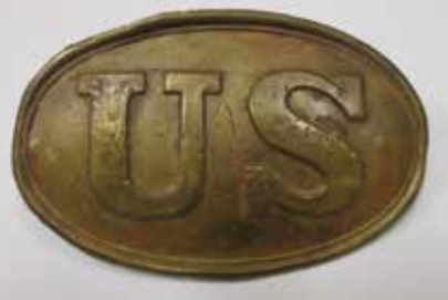
U.S. Cartridge Box Plate