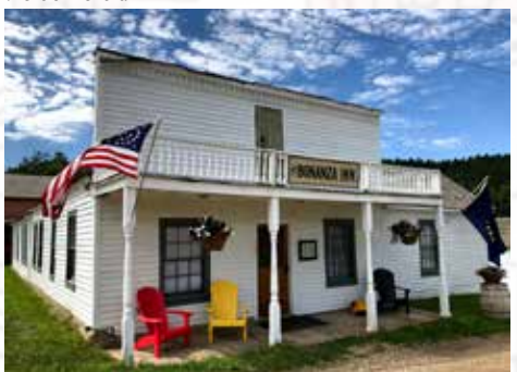
The Bonanza Inn bathrooms were remodeled, including electrical and plumbing upgrades as well as new furniture in the rooms.