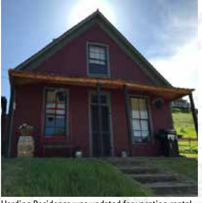
Harding Residence was updated for vacation rental.