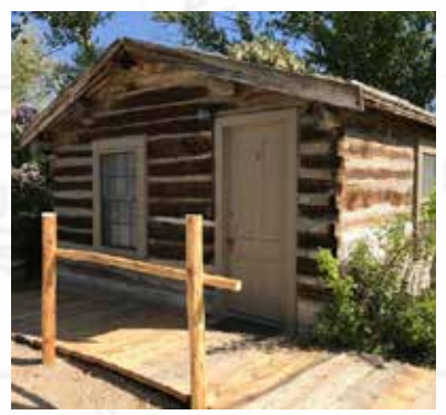
The Nevada City Cabins and Nevada City Hotel received updated bathrooms and furniture.