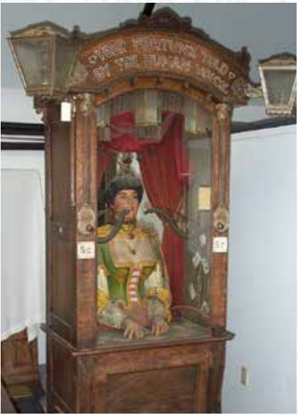
Gypsy Verbal Fortune Teller