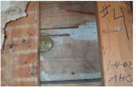
U.S. Cartridge Box Plate as found in the Bonanza Inn