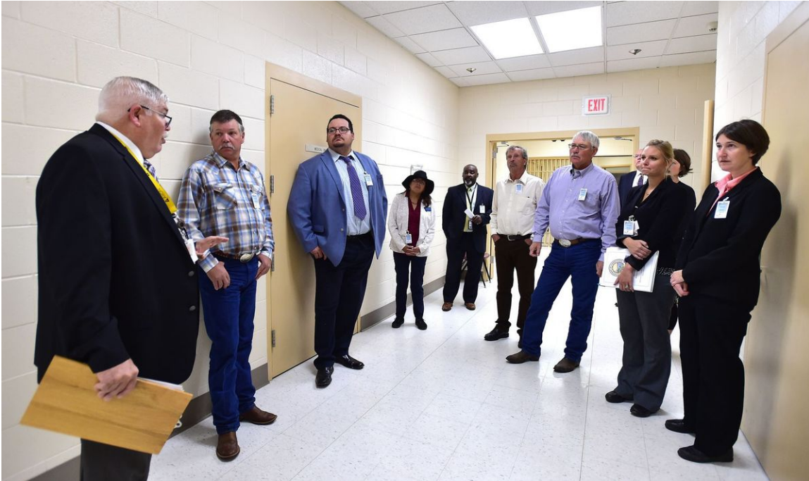
STATE-TRIBAL RELATIONS COMMITTEE MEMBERS MEET WITH WOMEN'S PRISON STAFF IN BILLINGS, SEPTEMBER 2017

In September 2017, the STRC visited the Montana Women's Prison in Billings to learn about rehabilitative programs used in the prison to help offenders deal with issues such as addiction that might have contributed to their incarceration and learn life skills that could smooth their reentry into the community.