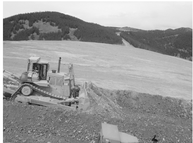
Zortman/Landusky Mine Reclamation

During the 2003-04 interim, the EQC heard testimony about the state's efforts to obtain adequate reclamation bonding for mines that are currently operating and the difficulty that it has in obtaining increased reclamation bonding for mines that are inactive. A panel presentation on the process of calculating, negotiating, and obtaining bonds for metal mine reclamation was also provided to the EQC. 1