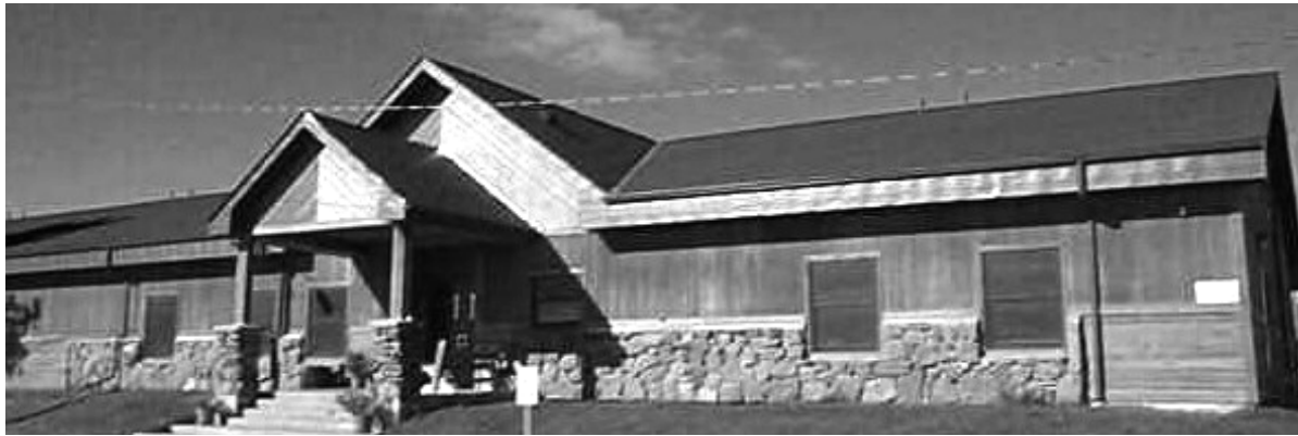
Fort Belknap College Multi-Purpose Building

allied health. A certificate in computer applications is also offered. Over 200 students are currently enrolled, many of whom will eventually transfer to 4-year institutions.