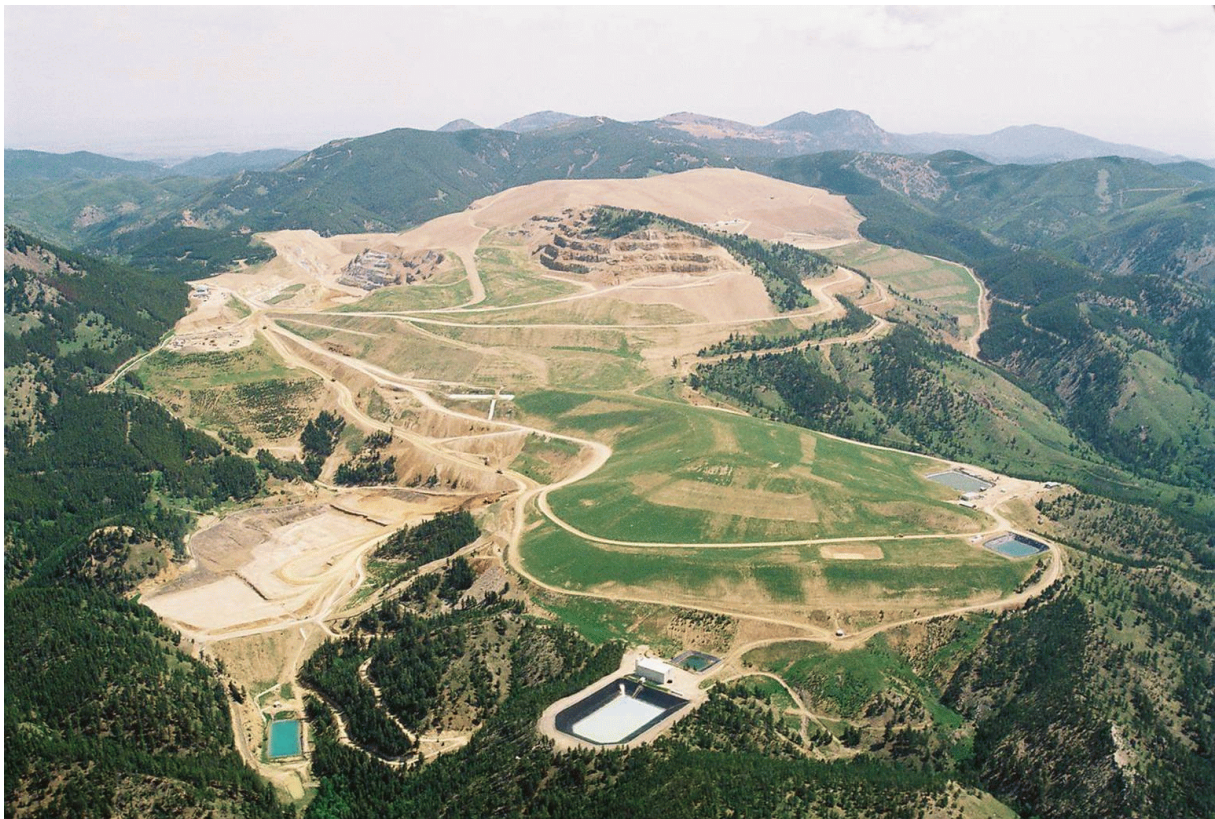
Landusky Water Treatment Plant, 2004.

One of the major issues facing the Fort Belknap Reservation for the last two decades is the reclamation of the Zortman and Landusky mines in the Little Rocky Mountains. The location of these mines was originally part of the Reservation, but when gold was discovered in 1895, the Tribes were forced to cede that portion of the Reservation to the federal government. 1 Among the largest open-pit cyanide heap-leach gold mining sites in the world, these mines leached cyanide into the