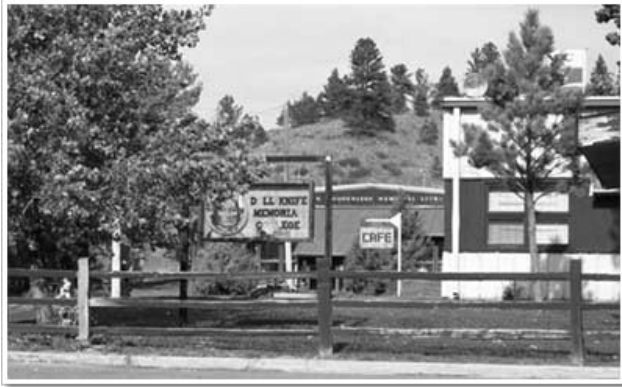
Chief Dull Knife College

educational opportunities to the Reservation as well as to surrounding communities.