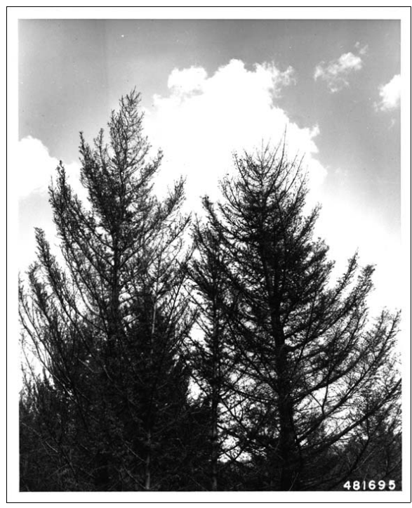
Defoliation from Spruce Budworm Gallatin National Forest

The general view of timber and log purchasers is that they are risk averse. That means that they are willing to pay more for contracts with lower risk than those with higher risk. Standard timber sale arrangements disperse risks in a variety of ways. Scaling or payment for the actual volume removed reduces the risk for sampling errors inherent in presale cruise volumes or in estimates of wood defect. Some contracts are "lump-sum" in nature. Here, the purchaser bears risk if a sale cuts out short. (Sellers that use lumpsum contracts often spend more money increasing the accuracy of sale volume estimates with more intensive sampling.) Some contracts have price escalation