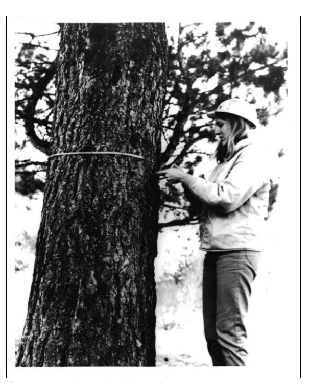
Forester measuring tree diameter, 1972 Lewis and Clark National Forest

A number of categories have been developed to describe timber and wood products. Those categories include things like: "number one sawlogs", "peelers", "studlogs", "pulpwood", "houselogs", "posts", "rails", "utility poles", and the like. The lines that separate these groups of products are rather fuzzy at best (certainly hard to decipher from a computer keyboard). Yet that is what a state forester does with a timber sale—create these product categories. A timber sale can yield an endless mix of products, and how these products are "imagined" will affect the total sale value. There will be