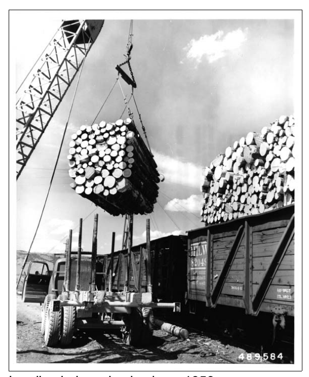
Loading lodgepole pine logs, 1956 Lewis and Clark National Forest

signed. Bid deposits would be required. Logs would not be removed from the sale area prior to receipt of payment. Advance payment is required by statute. A schedule specifying amounts and timing for making payments would be part of the agreement, or 100% of the bid amount would be required to be paid before any logs are cut and/or delivered. Payments can be made and credited in the TLMS at the unit, land office, or bureau level. Payments would typically be made directly to the bureau, at the unit office, or through the forester in charge of the field program.