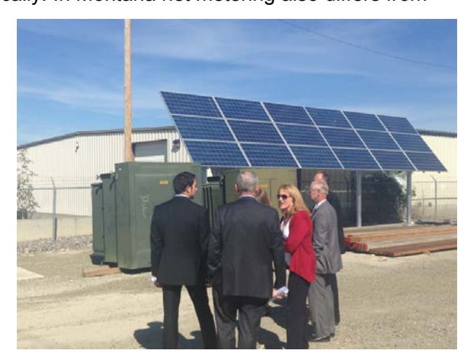
Members of the ETIC visit NorthWestern Energy's Battery Storage Project in Helena during a Sept. 2015 meeting.

Net metering is available on both the NorthWestern Energy (NWE) and the MontanaDakota Utilities (MDU) systems. Montana's rural electric cooperatives also offer net metering. Montana's net metering statutes codified in Title 69, chapter 8, part 6 only apply to NorthWestern Energy. Rural electric cooperatives are explicitly exempt from those