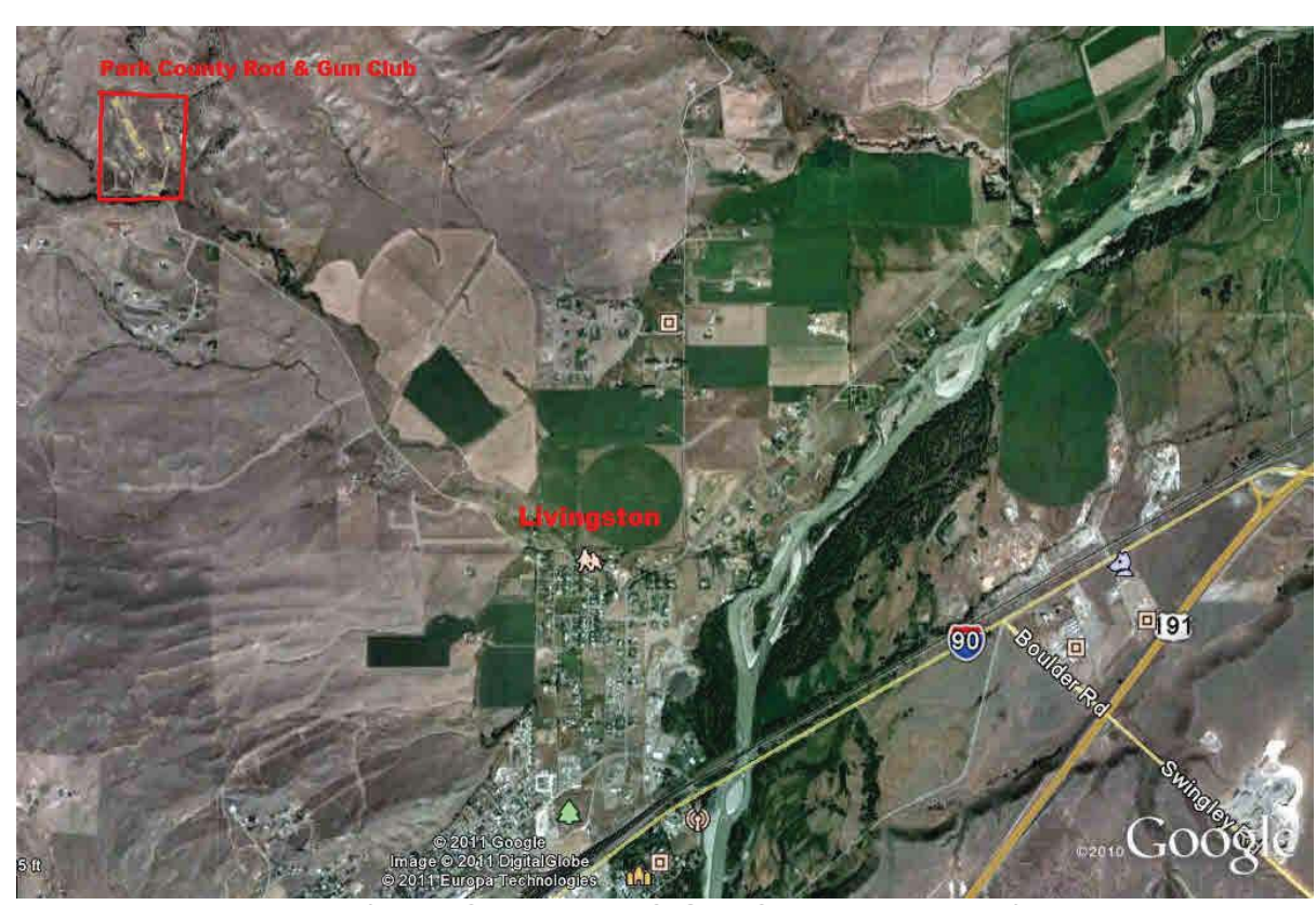
Map 1 - Location of Park County Rod & Gun Club northwest of Livingston, MT

The Park County Rod and Gun Club, of Park County, Montana, leases approximately 62 acres, from the Kensue Ranch of Park County, Montana. The property is located in the SE1/4 of Section 35, Township 1 South, Range 9 East, M.P.M. The property is northwest of Livingston, MT just off of Meigs Road.