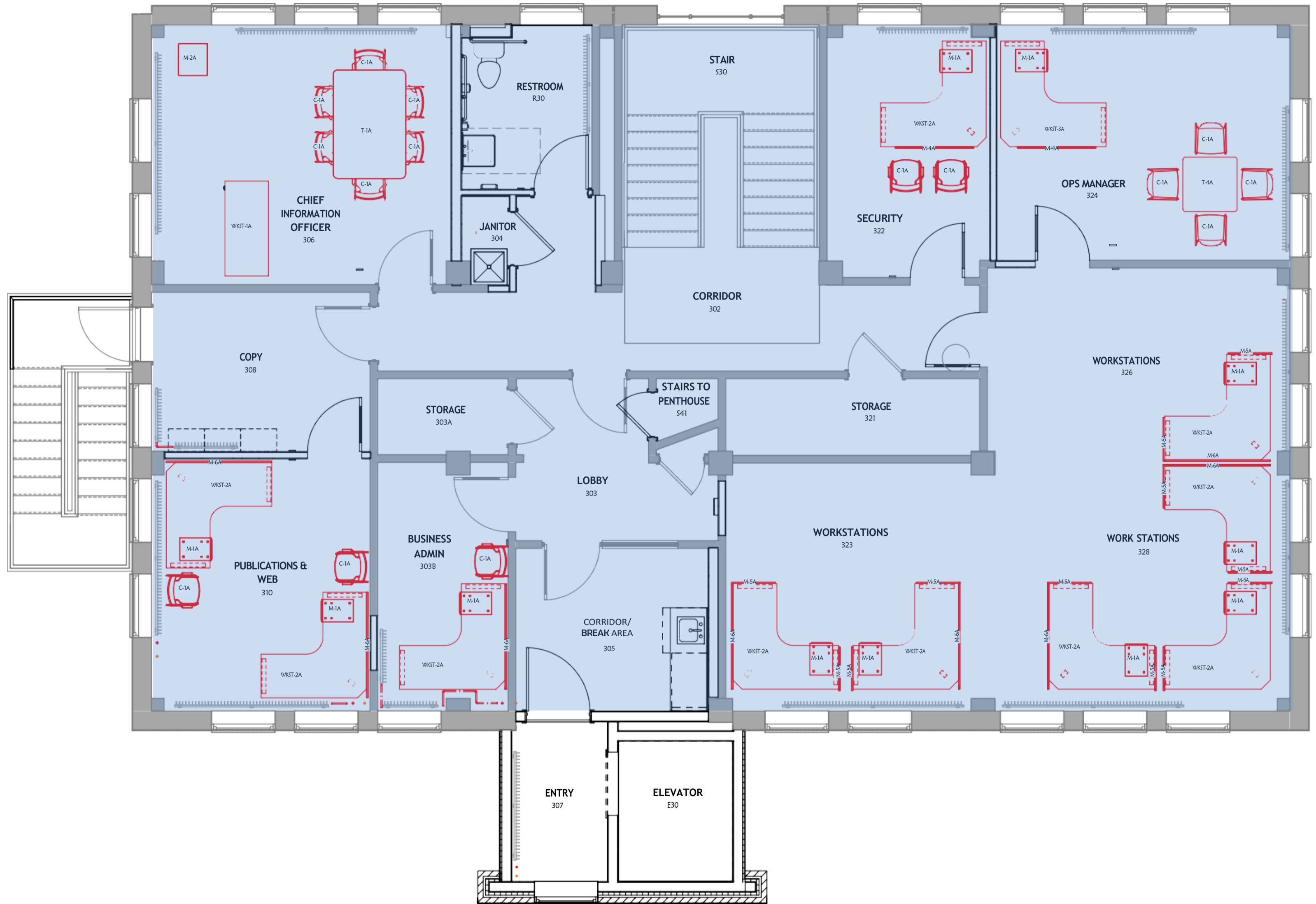
FURNITURE PLAN - THIRD FLOOR 3/8" = 1'-0"