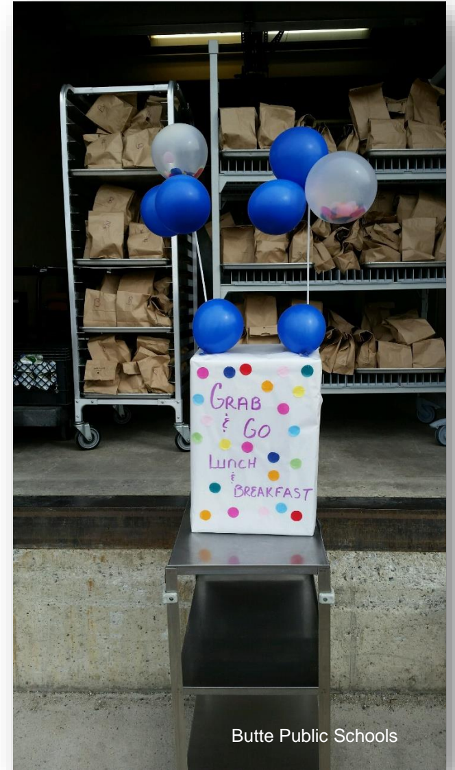
Butte Public Schools