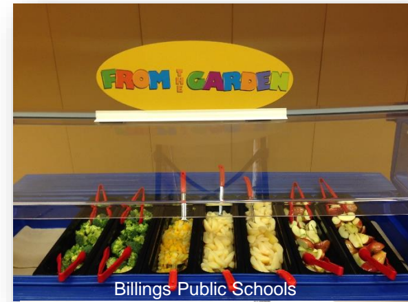
Billings Public Schools

* Recommended price; amount charged to households for paid lunches is a district decision and district is exempt from Paid Lunch Equity requirements if the district has a positive or zero balance in its nonprofit school food service account.