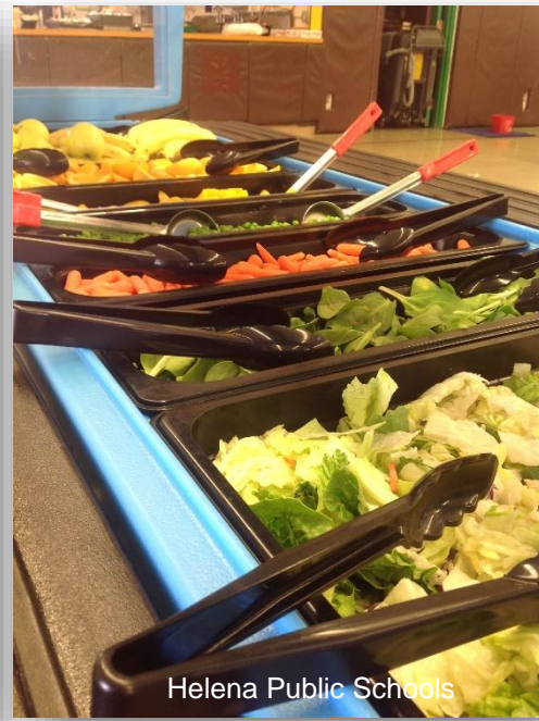
Helena Public Schools