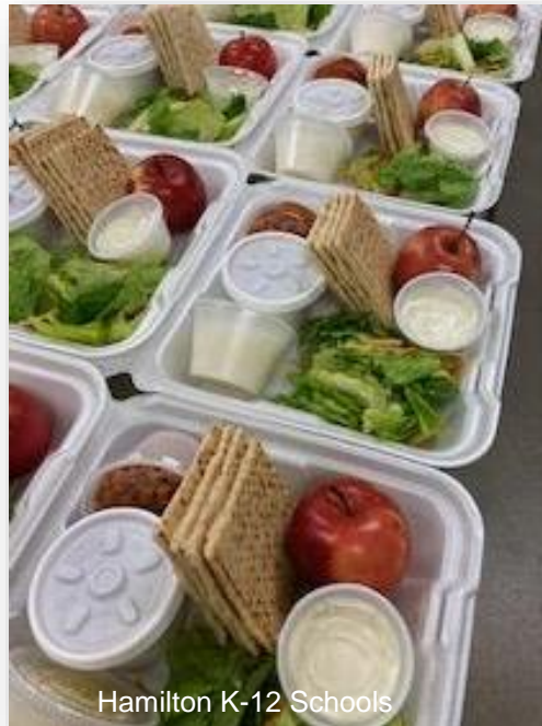
Hamilton K-12 Schools