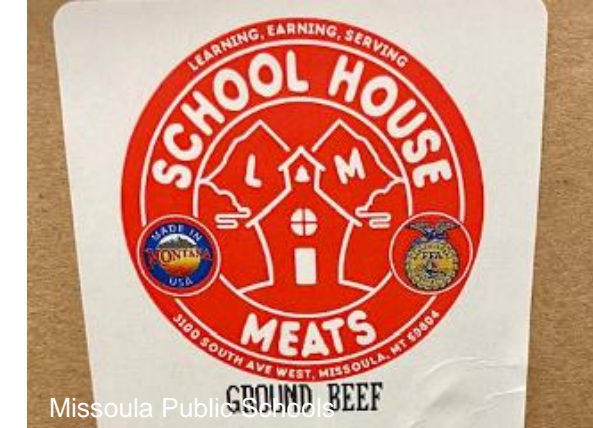
Missoula Public Schools