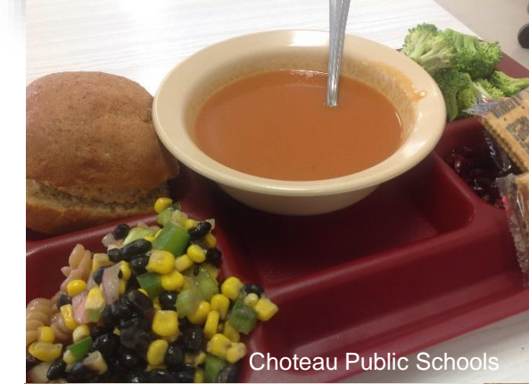
Choteau Public Schools