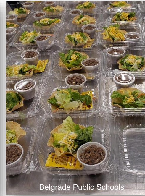
Belgrade Public Schools