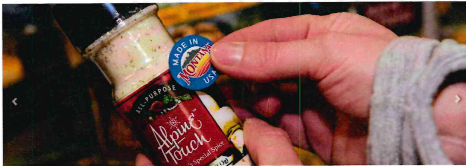
Made in Montana

Home Products Membership Tradeshow Taste our Place News Contact