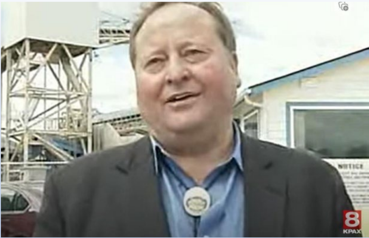
Former Montana Governor Brian Schweitzer

“We bought some time so that they could complete their negotiation with Smurfit Stone Container. Had we not slowed it down, there would have been a scrapper in here tearing this down and putting it on trucks and hauling it away and ending the dreams for all of Missoula County.”