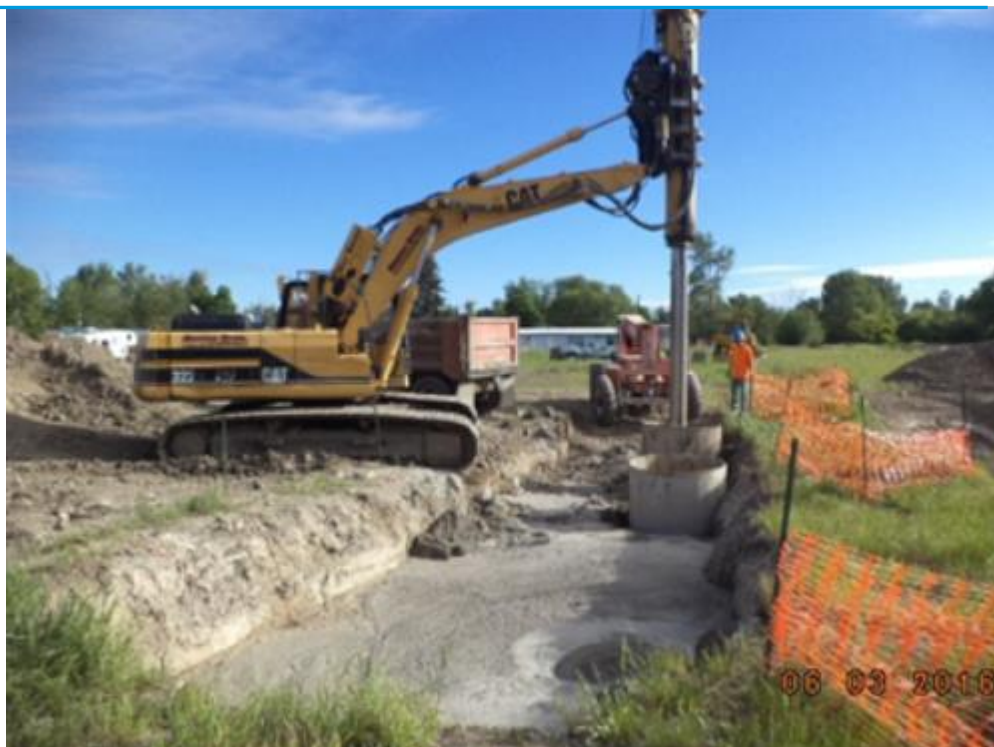
Auger excavation used near high pressure gas line at KRY Site

*To meet DNRC's complete obligation, which is based on DNRC's share of the full cleanup cost, a combination of HB5 appropriation and carry forward authority have been used.