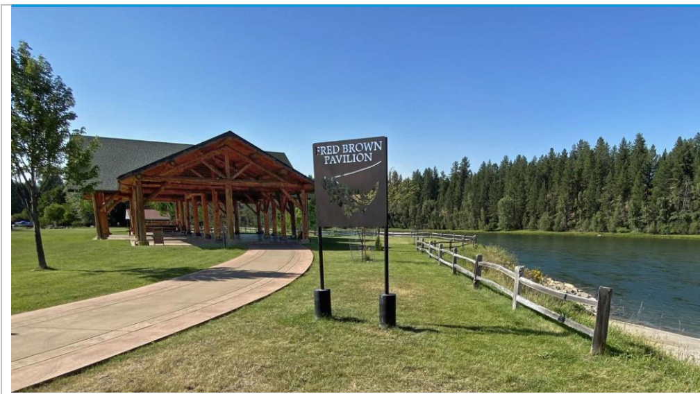
Libby Riverfront Park

$600,000 of Orphan Share funds are designated annually to establish a permanent Trust Fund to pay exclusively for costs to the State of cleanup and long-term O&M and to administratively cover costs of the Libby Asbestos Superfund Oversight Team per Sections 75-10-743(10)(c) and 75-10-704(4)(j)(i), MCA.