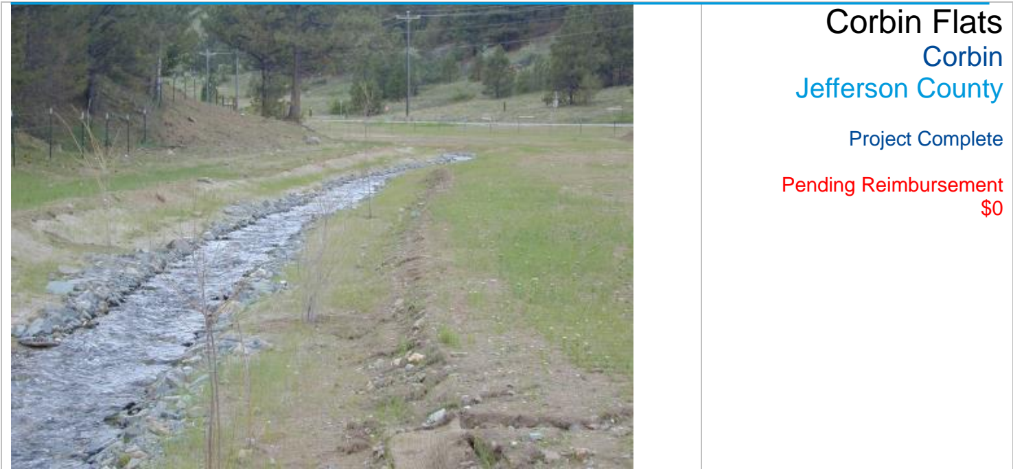
Corbin Creek after cleanup

The Corbin Flats Facility is located just south of Helena, in and near the town of Corbin, in Jefferson County. The orphan share for this site was determined to be 57%. Cleanup is complete at this Facility and all payments associated with the orphan share have been issued.