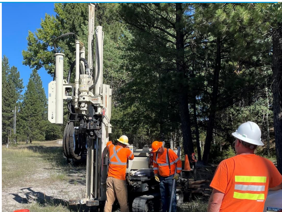
Field crew drilling to collect soil samples at Blackfoot Post Yard in August 2022

The Blackfoot Post Yard facility, located in Lincoln Montana, has an orphan share of 50% and the Montana Department of Transportation's (MDT) liability is 18% (see page 11 for information regarding MDT). MDT received $300,000 for the next biennium; MDT plans to use those funds to cover some of its contractor costs. This will enable MDT to conduct the necessary work to fulfil its obligations as the lead PLP. Remedial investigation field work was completed in 2022, with extensive soil and groundwater sample collection. MDT is compiling a remedial investigation report to summarize the 2022 data and the historic data from the facility. The remedial investigation report is expected to demonstrate the extent of contamination at the facility. DEQ anticipates a risk assessment will be conducted at the facility in late 2023 or early 2024. Due to the MDT's status as the lead PLP for the Facility, DEQ anticipates requests for reimbursement to be ongoing throughout the duration of the CECRA process.