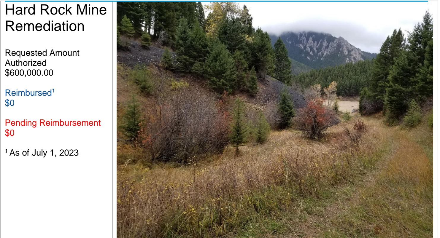
Abandoned Mine Lands site

Up to $600,000 may be used to cover costs of hard rock mine remediation per Sections 75-10-743(10)(c) and 75-10-704(4)(j)(ii), MCA.