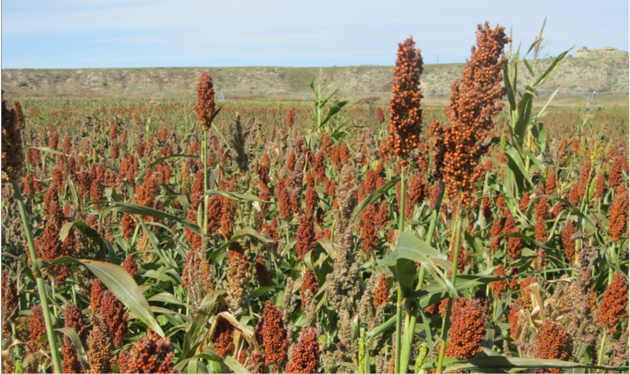
Figure 8. Irrigated food and cover plot on FWP Yellowstone WMA