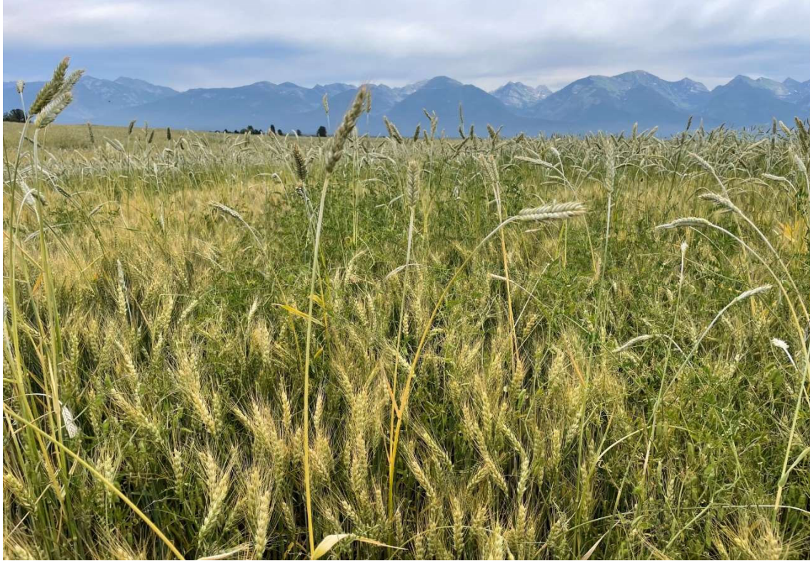
Figure 4. Small grain food plot on the Anderson WPA provides excellent habitat for pheasants while prepping the site for future seeding to a permanent native grass cover.