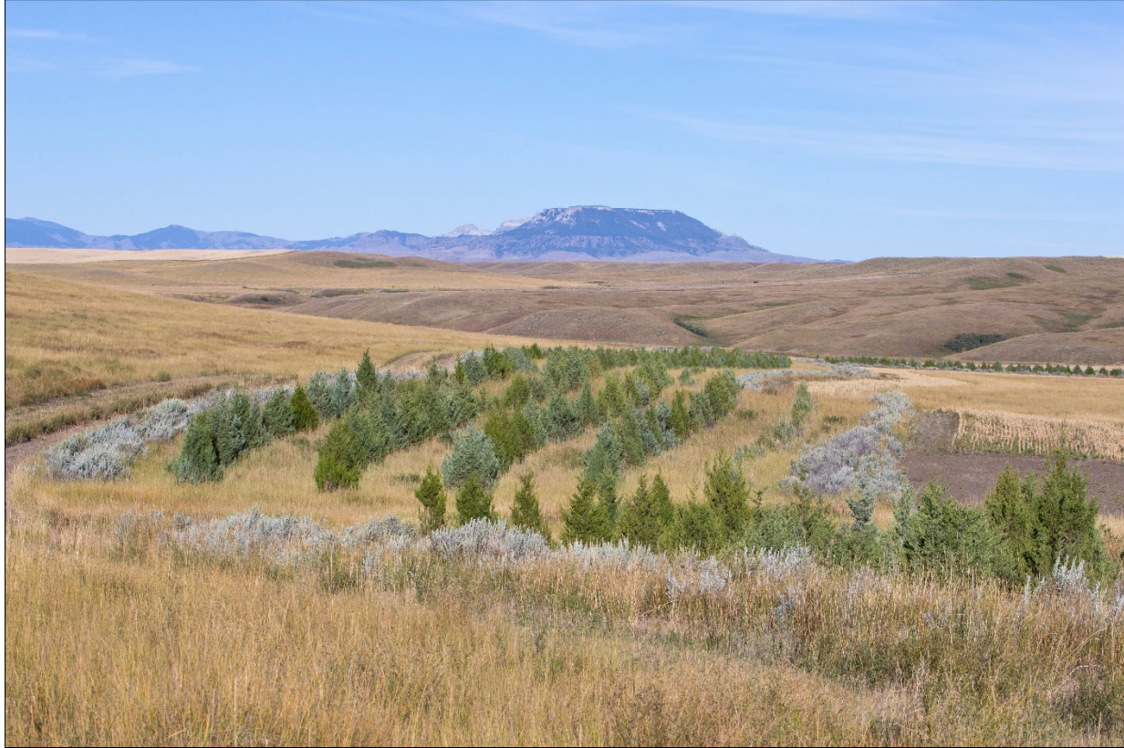
Figure 5. Mature shelterbelts, nesting/brood cover, and small grains are a part of the PF Coffee Creek property, culminating in a pheasant haven where birds thrive and hunters with dogs reap the benefits.