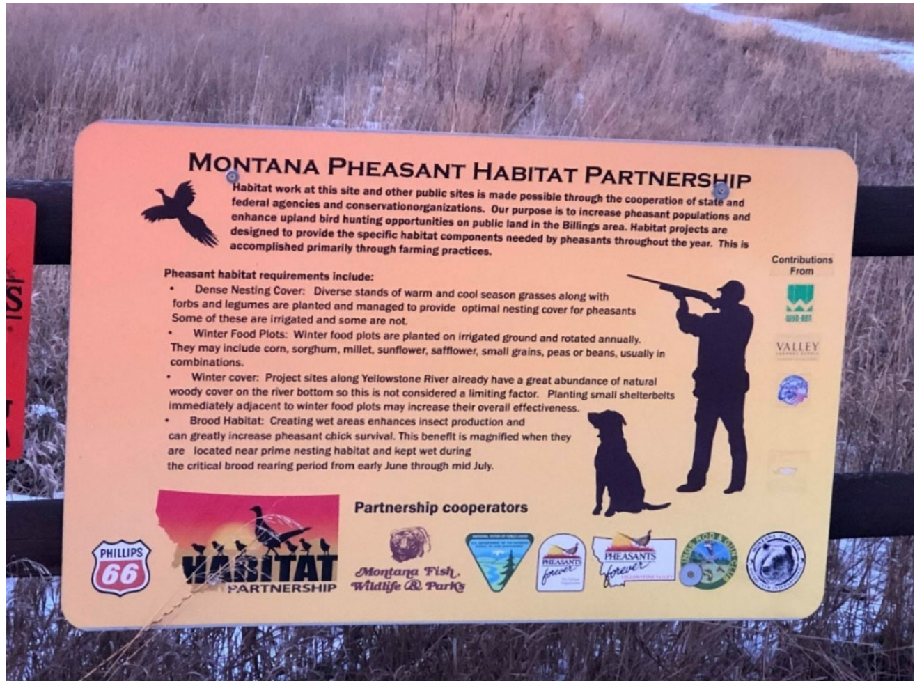
Figure 7. Montana Habitat Partnership sign located at BLM Pompeys Pillar.