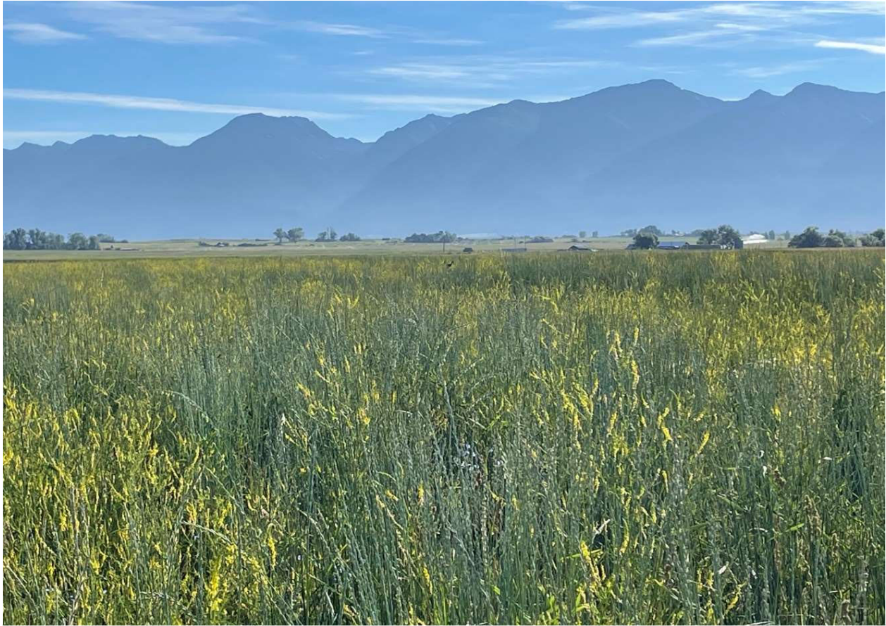
Figure 3. A 5-acre pollinator plot on the PF-80 area responded well to early mowing to manage weeds.