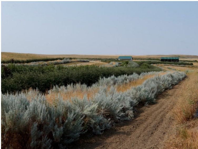
Figure 6. Tilling between shrub rows is an effective method to keeping weeds at bay and enhancing shrub growth.