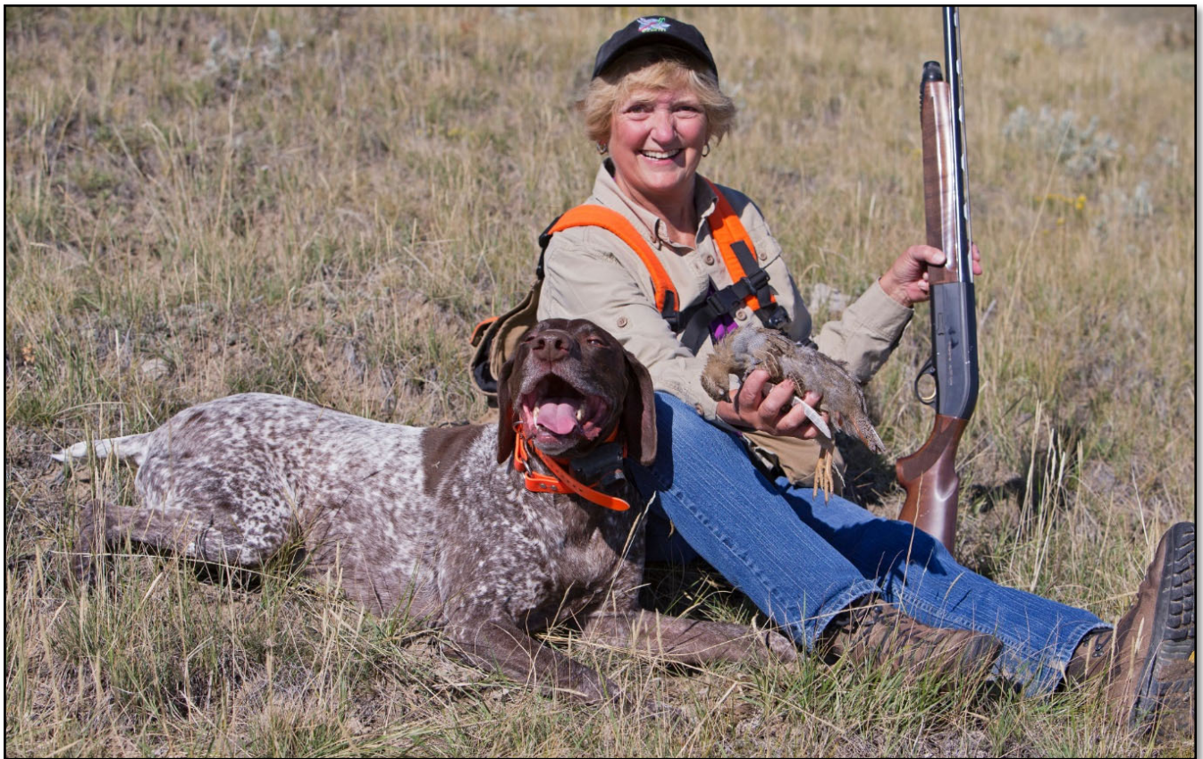
Figure 1. The UGBEP advances game bird conservation for the benefit of generations.

Montana is fortunate to have a program dedicated to upland game bird habitats and hunting access opportunities. The Upland Game Bird Enhancement Program (UGBEP) advances game bird conservation, providing the means for Montana Fish, Wildlife & Parks (FWP) and its partners to work directly with interested landowners and conservation partners to achieve abundant game bird populations. As changes in land uses intensify and hunting access becomes more difficult to attain, the value of the Upland Game Bird Enhancement Program appreciates (Figure 1).