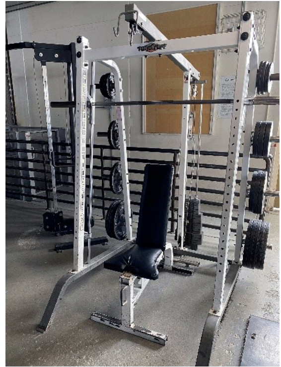
Weightlifting equipment at Montana State Prison purchased from the Inmate Welfare Fund.

We considered these items to be appropriate IWF expenses that were for the benefit of inmates and their families and not part of the state's responsibility.