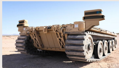
Render of Future RCV Vehicle with Kodiak Driver