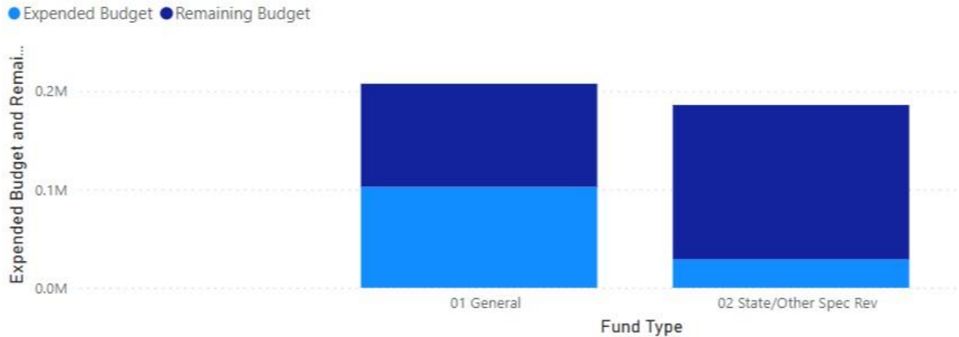
Expended Budget and Remaining Budget by Fund Type - HB 2 Only

The following chart shows the appropriated budget for the agency compared to expenditures through November 30, 2021.