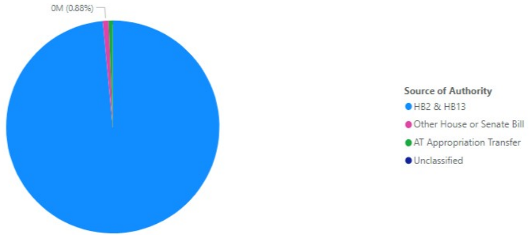
Total Appropriation Authority