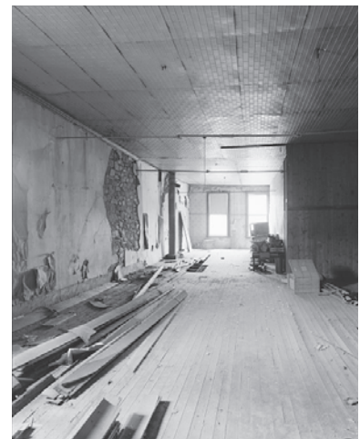
Stonewall Hall's second-floor chamber room today.