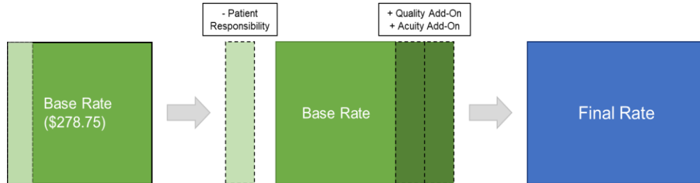
Figure 1: Base Rate and Final Per Diem Payment Components

As illustrated in the figure, the final rate includes the addition of a quality and acuity component to the base rate, minus the share of the rate that falls under patient responsibility. The quality and acuity add-ons are facility-specific and depend upon the performance and service characteristics of each facility, resulting in a unique final rate for each nursing facility.