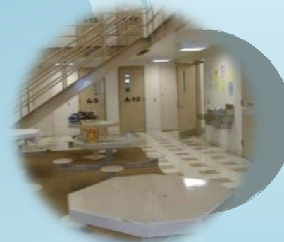
START Assessment and Sanction Center- Male