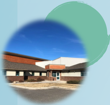
Elkhorn- Women's Methamphetamine and Dual Diagnosis Treatment Center