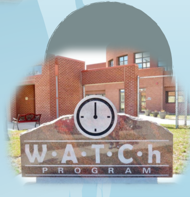
Watch- West Men's DUI Program