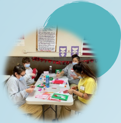
Passages Alcohol and Drug Treatment Women