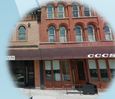
Butte Pre-Release Center