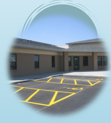
Nexus -Men's Methamphetamine and Dual Diagnosis Treatment Center