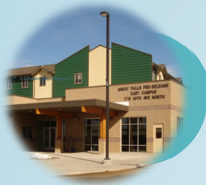
Great Falls Transition Pre-Release Center