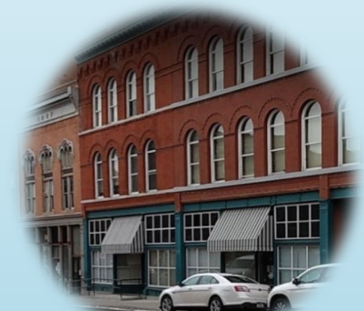
Women's Transition Pre-Release Center