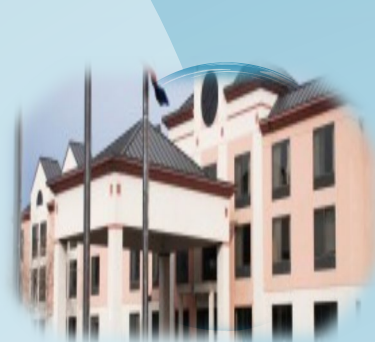
Passages Pre-Release Center