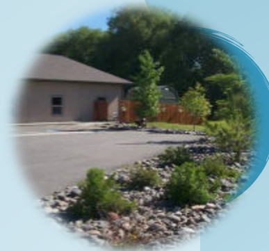
Gallatin County Re-entry Pre-Release Center