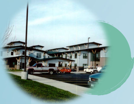
Missoula Pre-Release Center