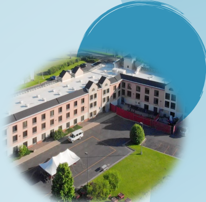
PARC- Female DUI Program