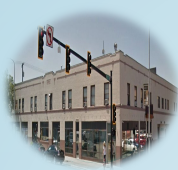
Alpha House Pre-Release Center