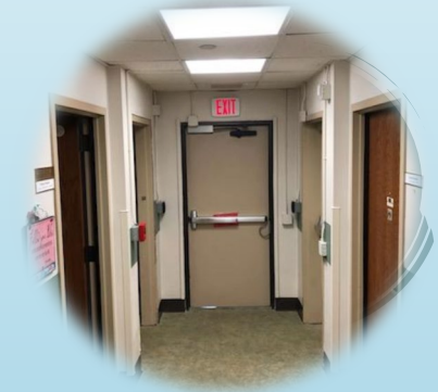
ASRC Assessment and Sanction Center- Female