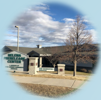
Helena Pre-Release Center