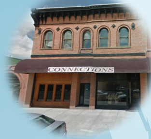
Connections Corrections Program-West Alcohol and Drug Treatment Center- Men