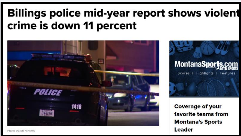
FKTVQ headline; screen capture

It's not easy to quantify the impact three additional agents had to the overall effort in combating violent crime. Local and federal agencies redirected many of their own resources to the problem as well. In August of 2023, the Billings Police Department's midyear report indicated that violent crime had decreased 11% in the first six months and in April 2024, they reported that violent crime was still decreased but juvenile incidents had increased. Although the news is encouraging, there continues to be a collaborative effort from many levels of both government and public resources.