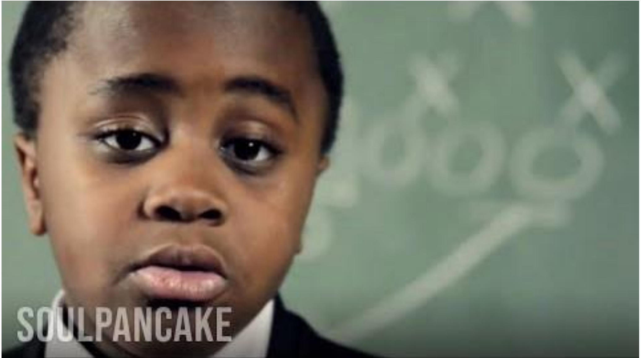
A Pep Talk