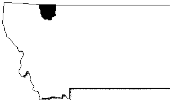
Location of Blackfeet Reservation

The Blackfeet Reservation is located in one of the more scenic areas of Montana. Nestled along the Rocky Mountain Front, the Reservation stretches from the United States-Canadian border 50 miles south to Birch Creek and from the edge of Glacier National Park 45 miles east to Cut Bank. The Reservation encompasses about 1.5 million acres of high, rolling prairies interspersed with rivers and creeks. The mountains along the western border range in altitude from 4,400 to 9,600 feet. Of the 1.5 million acres, approximately 66% are Indian-controlled. The land is used primarily