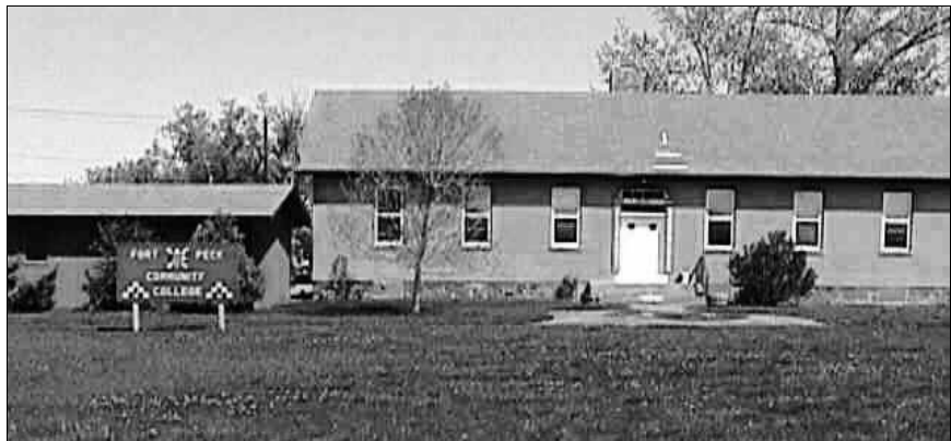
Fort Peck Community College ( http://www.fpcc.edu/ )

Postsecondary education extension courses were first offered on the Fort Peck Reservation by Dawson Community College in 1969. In 1977, the Fort Peck Tribes entered into a cooperative