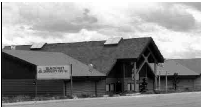
Blackfeet Community College ( www.bfcc.org/ )

In 1972, the Tribal Business Council developed a 10-year comprehensive plan that included a community college or a vocational-technical school. Two years later, the Tribe chartered the Blackfeet Community College (BCC). The Tribe entered into an agreement with Flathead Valley