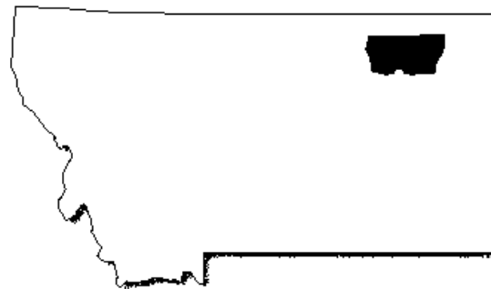
Location of Fort Peck Reservation

Roosevelt Counties. Elevation varies from 1,900 to 3,100 feet. The land is primarily gently rolling hills and plains. The land is nonforested except for stands of cottonwood along the creek and river bottoms.